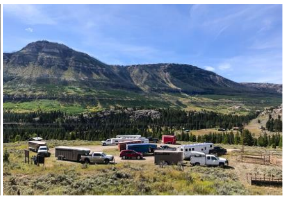
Jack Creek Corrals